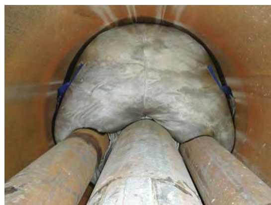
Prototype Test (View Looking Up)