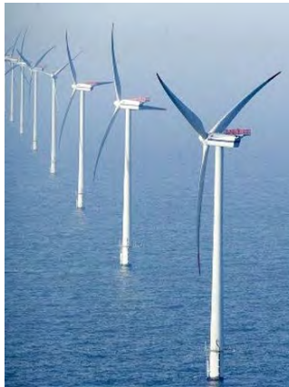
Offshore Wind Farm

Suction caissons are of considerable interest as foundations to wind turbine mast bases due to their construction officially. However, their use as large bases to resist operational overturning movements is a relatively new development and requires methods to ensure complete bearing contact is made to the underside of the caisson cell.