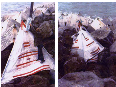
Repair Above Water

The bottom of the infill block forms an intimate shape to adjacent units and neighbouring repairs need to be spaced or shaped, to maintain revetment porosity. Repair blocks can be shaped to provide matching upstand legs for interlock, using shaped mesh formers which are lost or by using removable top shutters. Where a particular infill arrangement is required, it can be developed and demonstration tested.