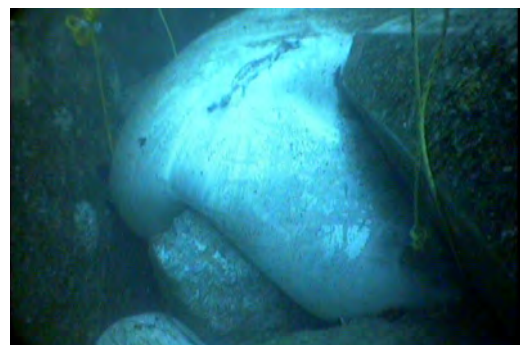
Repair Under Water

Initially the infill units produce a more intimate and stabilised arrangement, although this changes if movement is progressive. For stability comparisons, the coefficient of friction between insitu fabric formwork units and smooth concrete armour units has been determined by testing to be 0.48. If required, degradable hessian forms can be used to match frictional properties between concrete units, or repair armour weight can be increased accordingly.